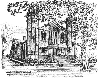
St. John's Episcopal Church Broad and Wheeling Lancaster, Ohio