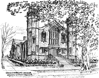
St. John's Episcopal Church Broad and Wheeling Lancaster, Ohio