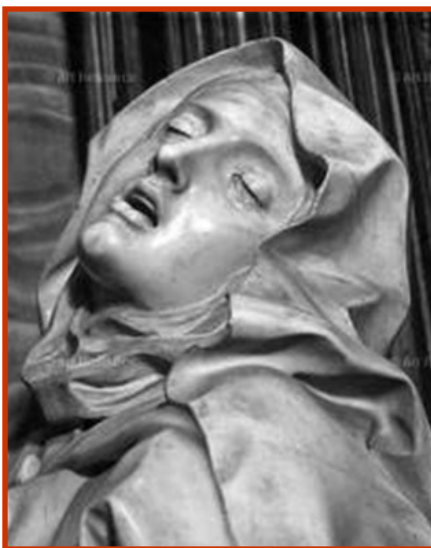
detail from L'Estasi di Santa Teresa Santa Maria della Vittoria, Rome Gian Lorenzo Bernini

My prayer for all of us this Lent is that the Holy Ghost would convict us all and give us at least one or two sleepless nights and rather miserable days- days when we will not have to fast, because our sorrow over the things we need to change in our lives will render us unable to eat with any sense of satisfaction or enjoyment. Most of us, indeed all of us from time to time continue doing what we have always done and never really thought about. That doing hurts people around us and forms a callous on our souls that prevents us from seeing who God would have us to be. I sincerely pray that our Lord would help us to see through our own inattention and self satisfaction in these next few days and so enable us to purge from our lives something that really needs to go.